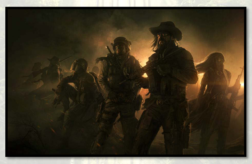
Thank you for purchasing Wasteland 2!

From the very beginning, it's been our dream to bring you a worthy follow-up to Wasteland , the grandfather of post-apocalyptic role-playing games on the PC. The game holds a special place in our hearts, and we are absolutely and completely thrilled and humbled by the incredible outpouring of support from our fans in allowing us to create Wasteland 2 , whether that's on Kickstarter or through their own independent donations.